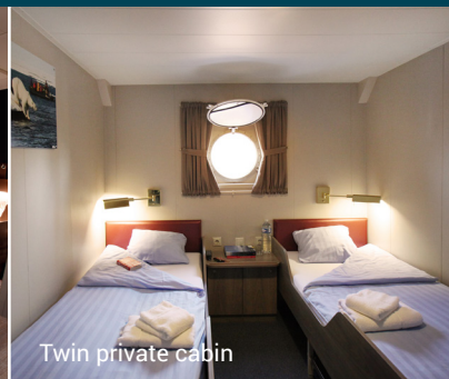
Twin private cabin